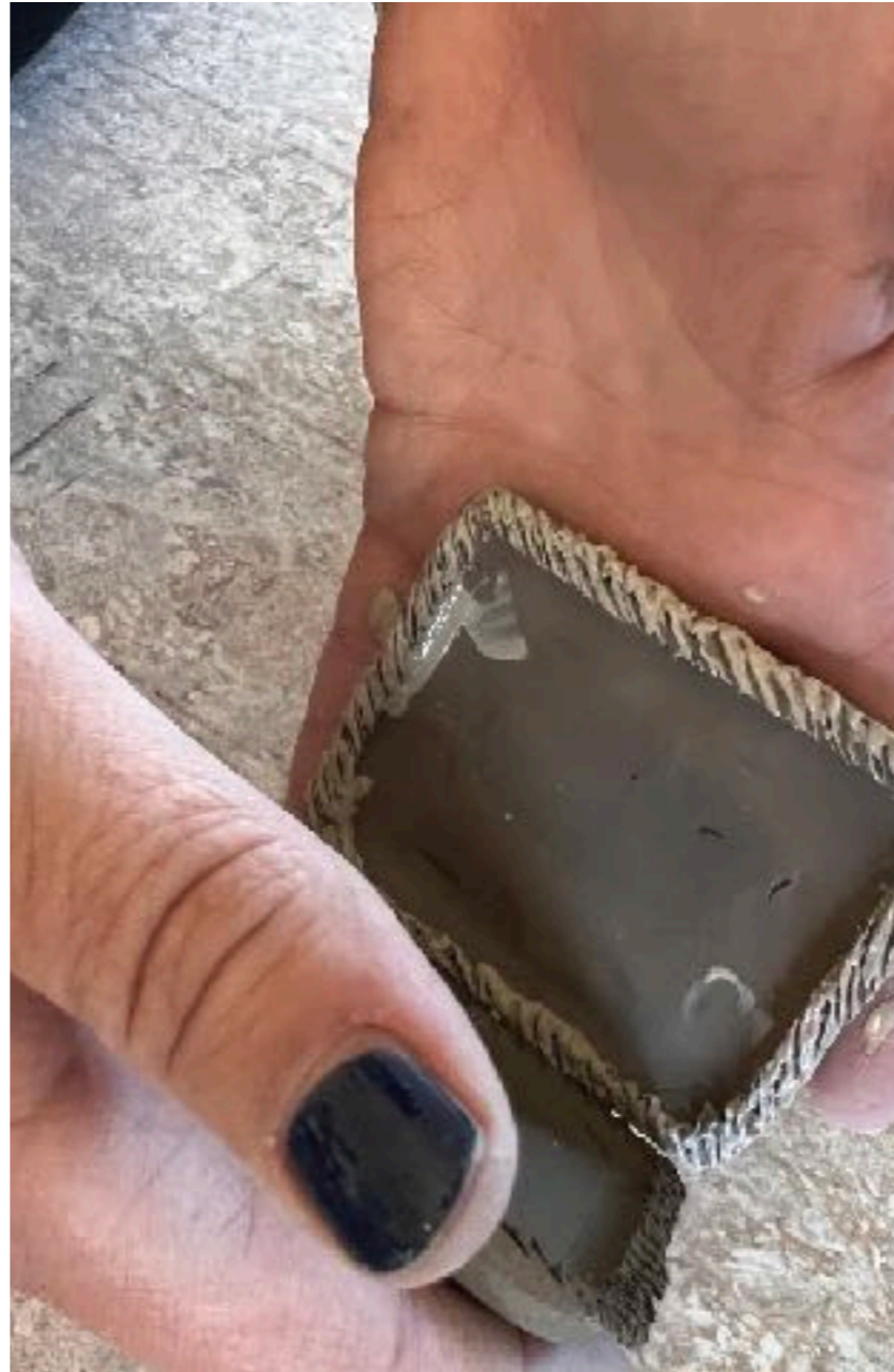
Attach both halves together.