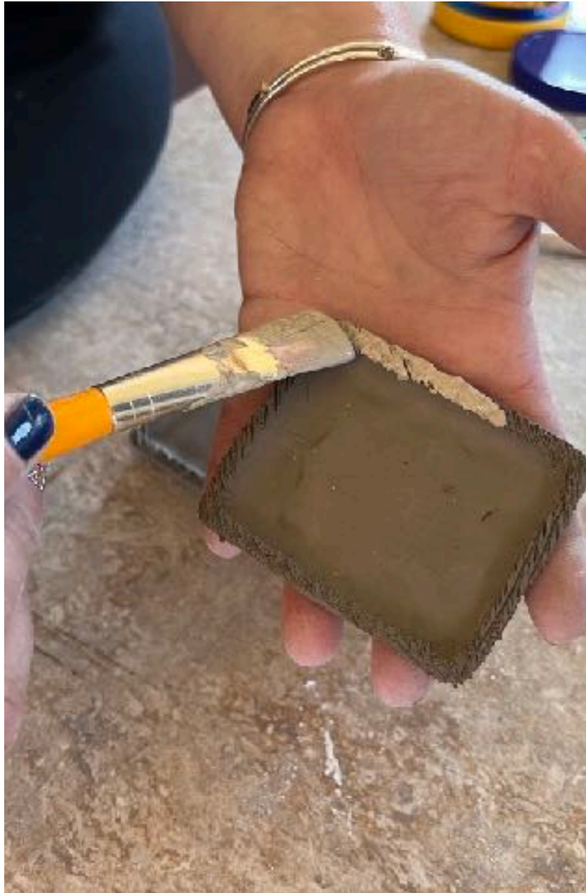
Slip and score.